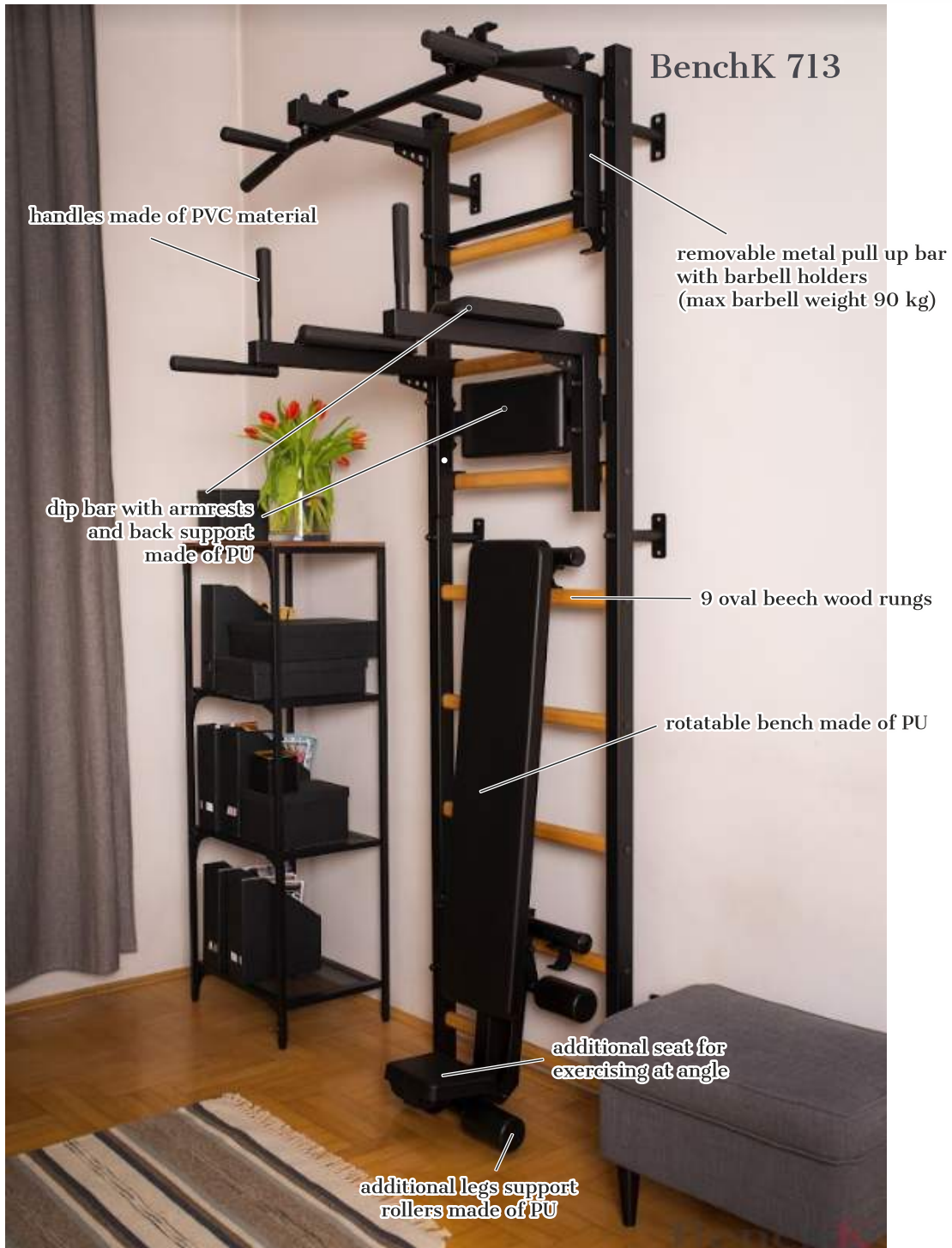
BenchK 710 series