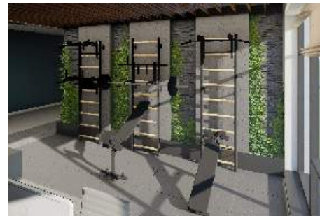
BenchK 710 series ..... 24-26