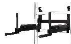
Dip Bar DB510