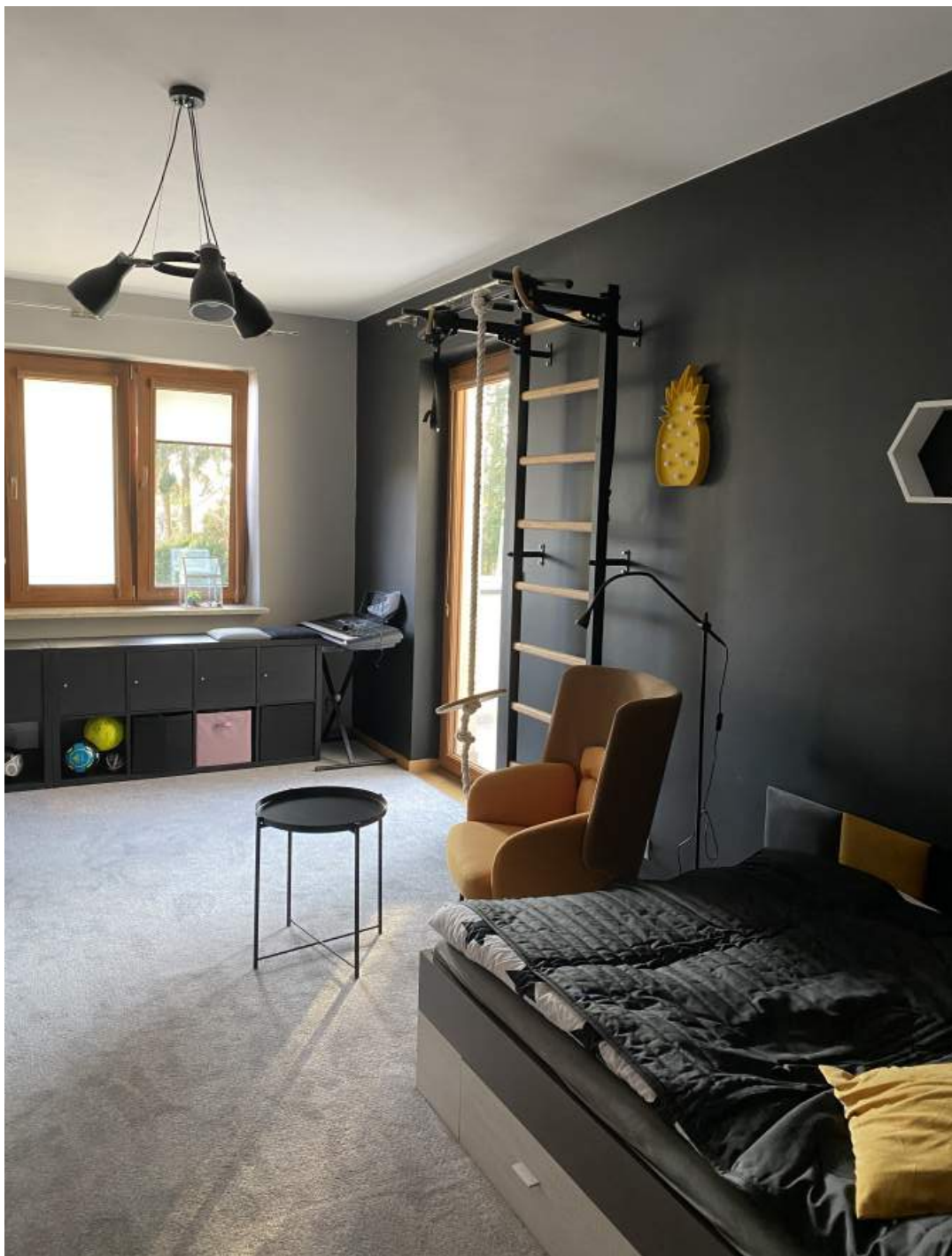
BenchK 310 series