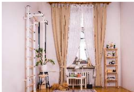
BenchK 410 series ..... 20-22