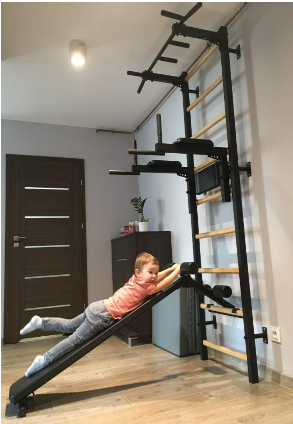
BenchK 310 series