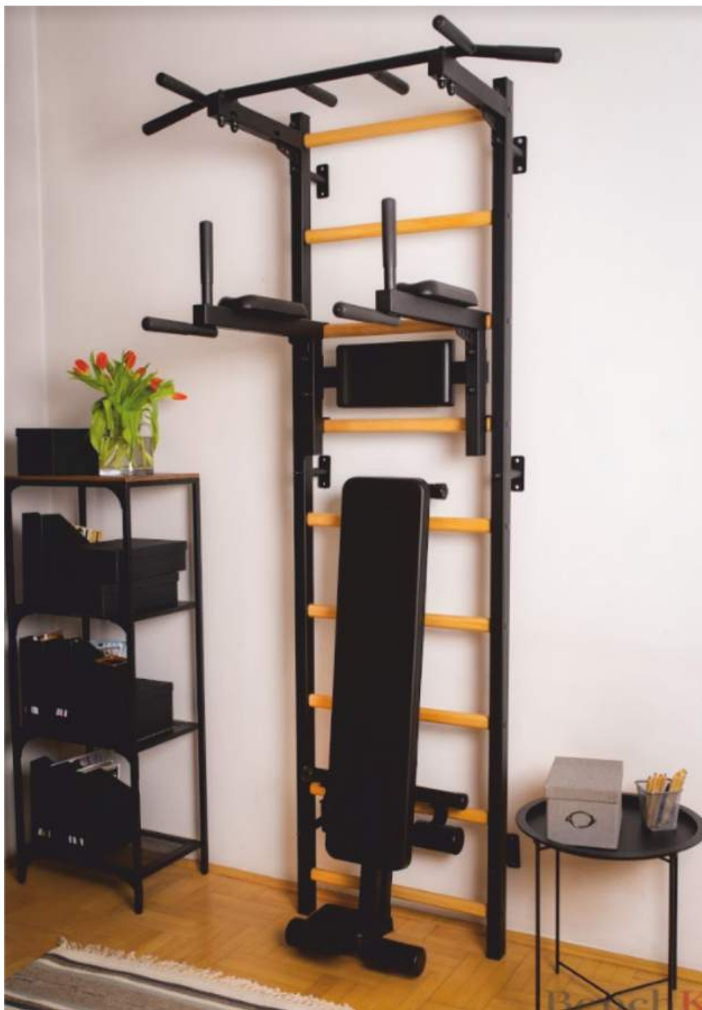
BenchK 310 series