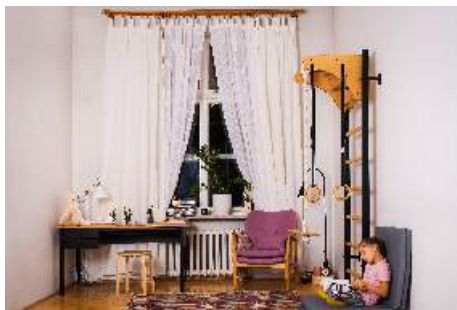
BenchK 210 series ..... 10-13