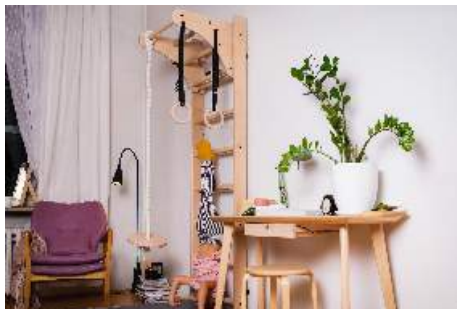
BenchK 110 series ..... 6-9