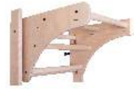
Pull Up Bar PB 110.1