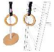
Accessories for children A/076