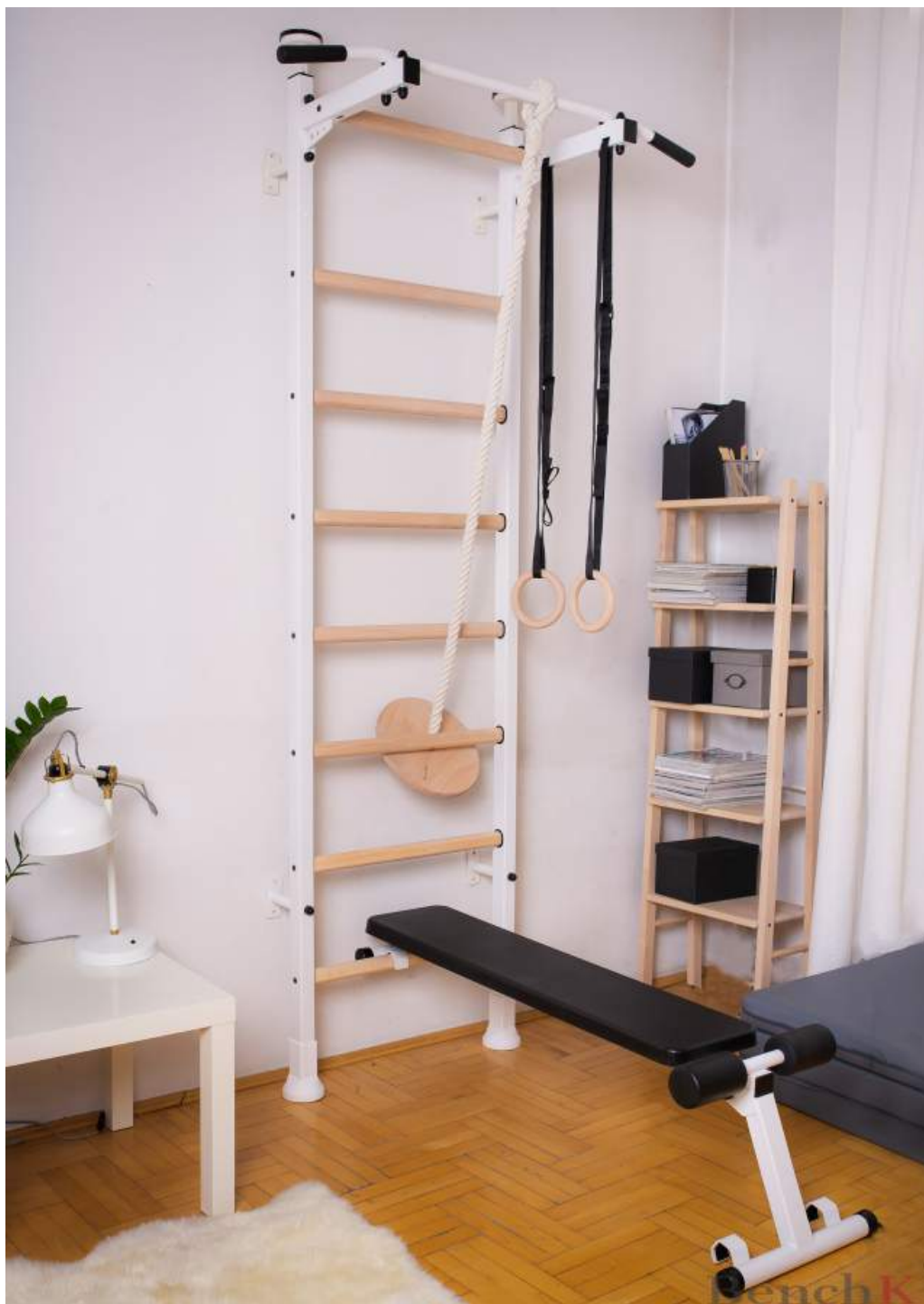
BenchK 410 series