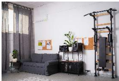
BenchK 510 series ..... 23