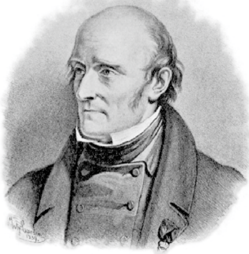
Pehr Henrik Ling