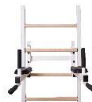
Dip Bar DB410