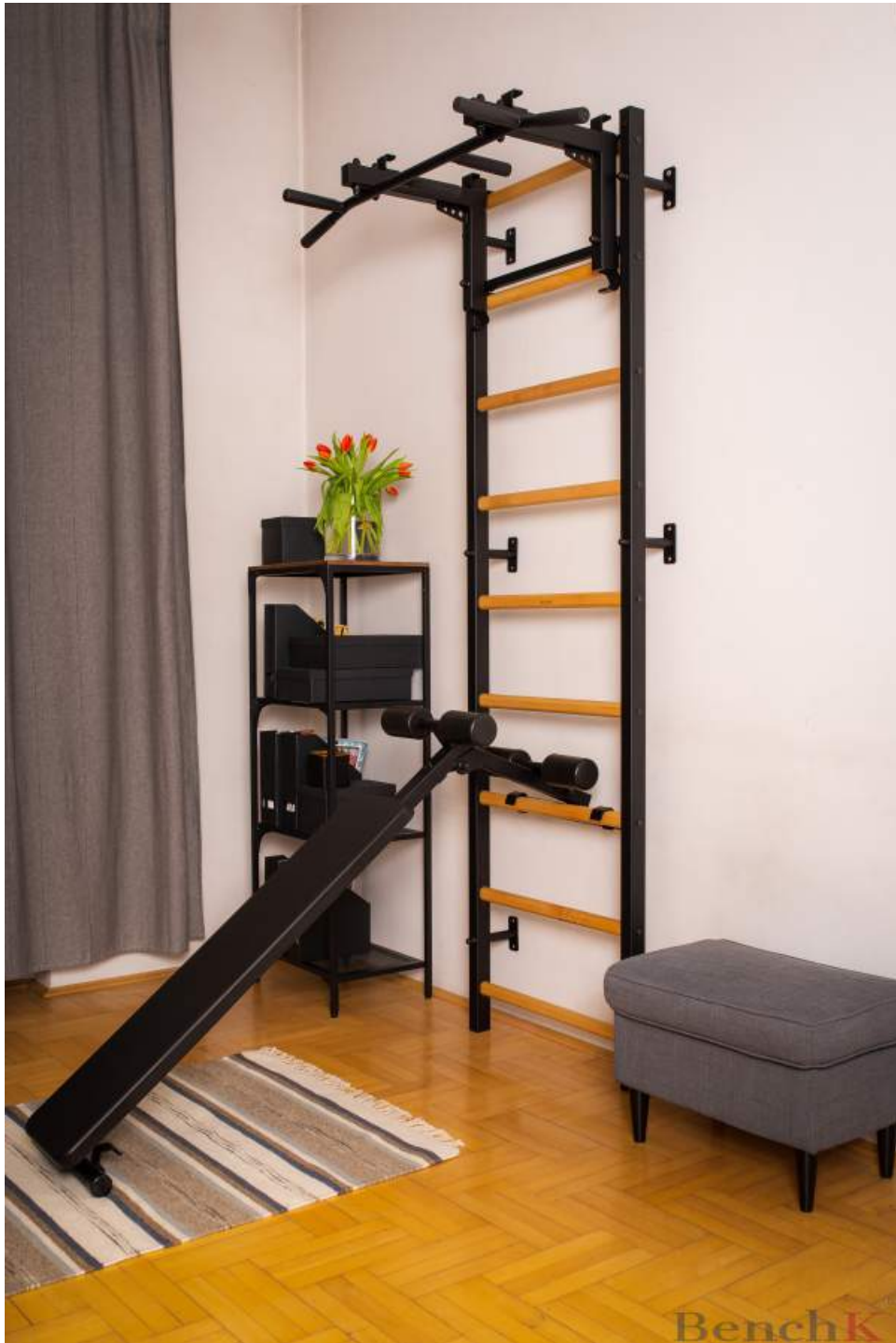
BenchK 710 series