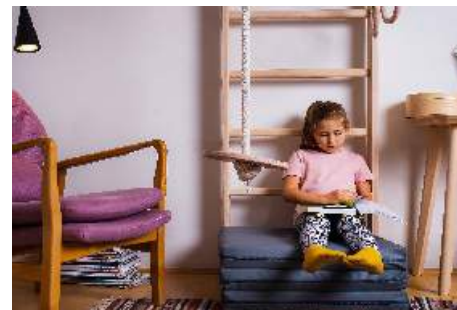
Gymnastic mat ..... 29